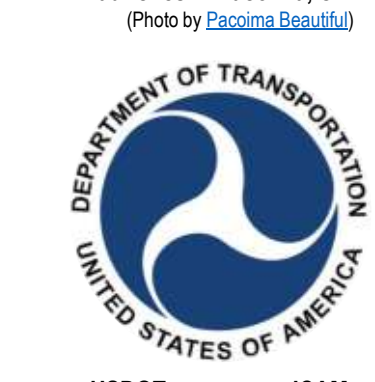
USDOT announces ICAM Pilot Program grants