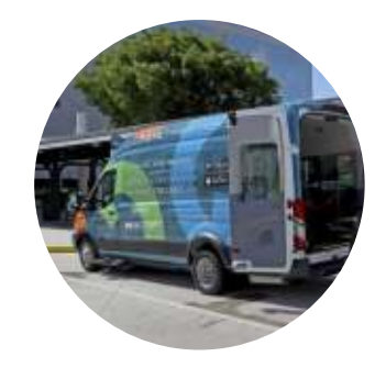
Freebee on-demand shuttle service expands