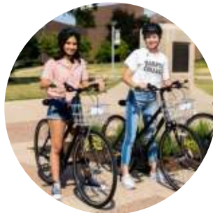
Harper College partners with Koloni for bikeshare