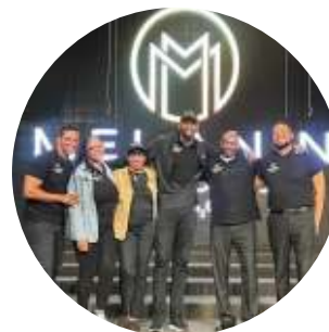
Rideshare for individuals with dementia launches