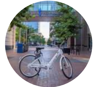
Electric bikeshare pilot goes live in Boise, ID