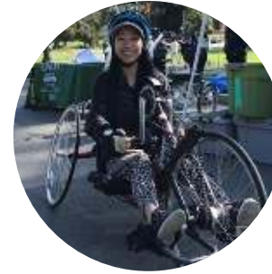
Permanent adaptive bike-share program rolls out