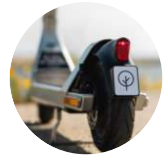
Redwood City, CA & Bird launch scooter program