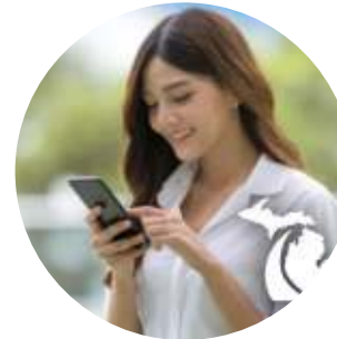
Michigan announces Mobility Wallet Challenge