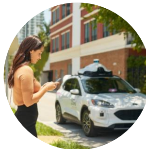
Lyft & Argo AI roll out AV ridehailing in Austin, TX