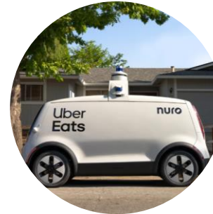
Nuro & Uber partner for automated food delivery