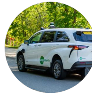
May Mobility & Via team up for AV shuttle service