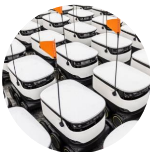
Chicago City Council approves delivery pilot