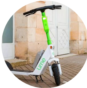
Tualatin, OR launches electric scooter pilot