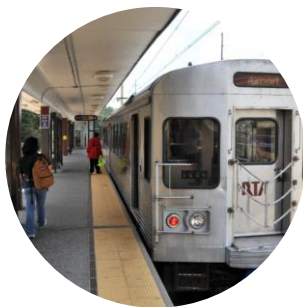
GCRTA partners for last-mile mobility for workers