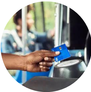
Elavon launches mass transit payment platform