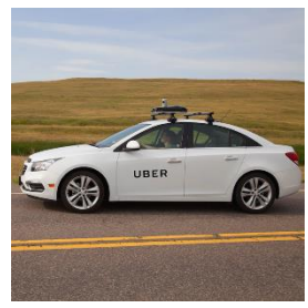
Uber is spending $500M to map roads?