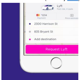
Coming soon: Multiple stops for Lyft rides