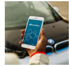
BMW's ReachNow reaches 40K members