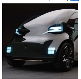
NeuV – Honda's automated EV that feels