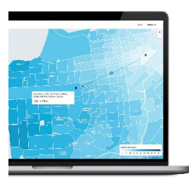
Uber releases data with Uber Movement