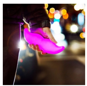
Review of 2016 – Lyft's breakout year