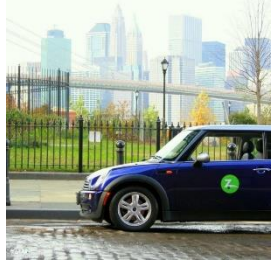
NYC street parking spaces for carshare