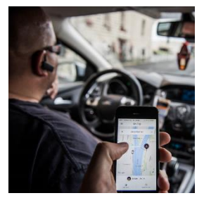
Cheaper commutes: Uber vs. driving