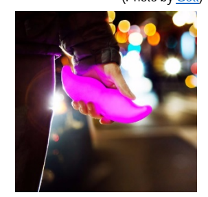
Lyft partners to offer safe rides in Maricopa County

Ridehailing app, Gett acquires Juno