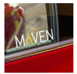
Maven rents Chevy Bolt to TNC drivers

Bridj suspends all services