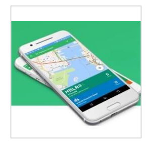
Cascades East Transit develops a new app