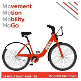
Bikesharing program, MoGo, launches in Detroit