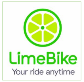
UNCG & LimeBike partner for dockless bikesharing