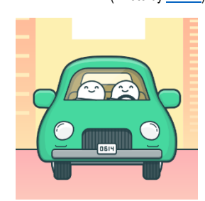
Waze launches carpooling app in California June 6th