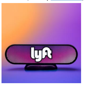
Lyft offers free rides for Las Vegas cancer patients