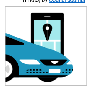
Uber partners to prevent drunk driving in Texas