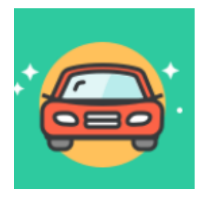
HyreCar & Lyft partner in Los Angeles