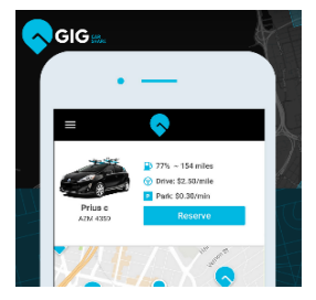
GIG Car Share offers ridesharing in California