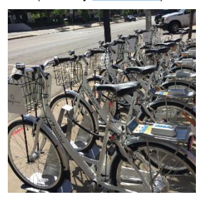
Zagster & Enjoy Peoria launch new bikeshare