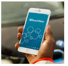
ReachNow adds 100+ Seattle charging stations

GoBike service expands in SF this summer