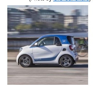
Filld & car2go expand mobile fueling partnership