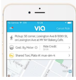
Via & Curb bring ridesharing to NYC taxis