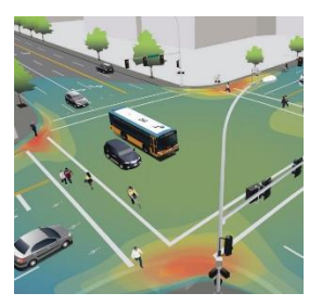
City of Bellevue's Vision Zero Partnership