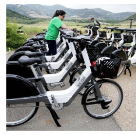
Fully electric bikeshare program begins in Utah