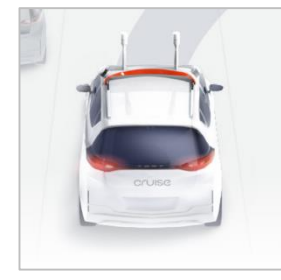
GM's Cruise to launch ride-hailing application