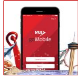
Via releases new tripplanning & ticketing app