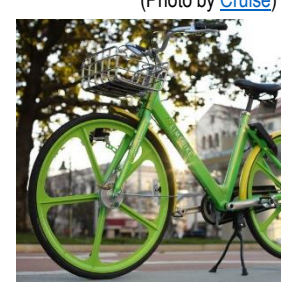
New bikeshare comes to South Bend, Indiana