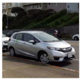
Zipcar to expand its San Francisco street parking