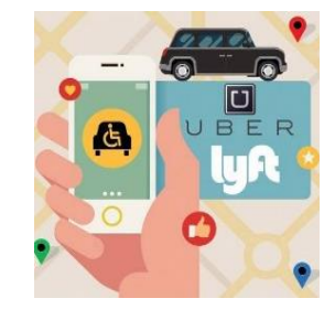
Uber & Lyft in Philly up wheelchair accessibility