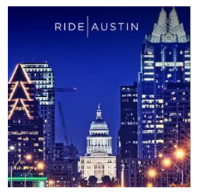
Ride Austin partners to provide medical access