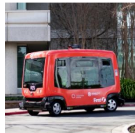
Contra Costa County to test autonomous shuttles