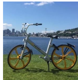
VBikes to launch 1-year bikeshare in Irving, TX