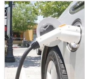
Western states to expand the EV charging network