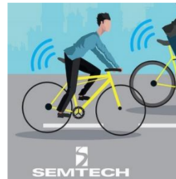
Ofo bikeshare & Semtech partner to track Ofo bikes