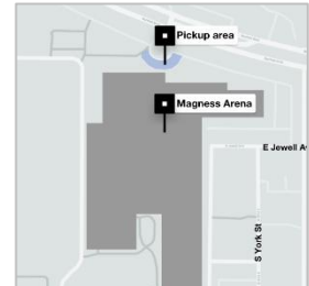
Uber partners with Denver Athletics & Recreation