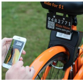
Spin bikeshare & Furman SGA launch partnership