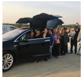
Van y Vienen ridesharing comes to rural Fresno, CA