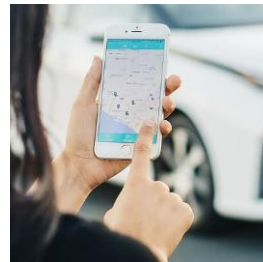
StratosFuel to launch CA zero-emission carsharing