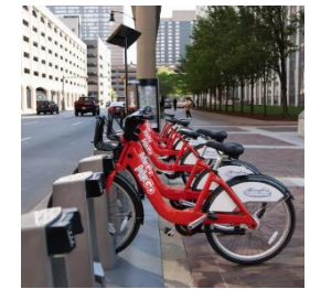
MoGo to launch adaptive bikeshare pilot program