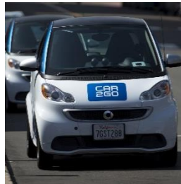
Car2Go can be reserved via Amazon's Alexa now