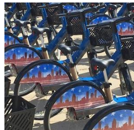
Baltimore re-launches its bikeshare after updates