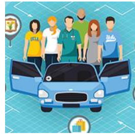
UCLA partners for flat-rate uberPOOL service