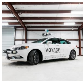
Self-driving taxis come to FL retirement community