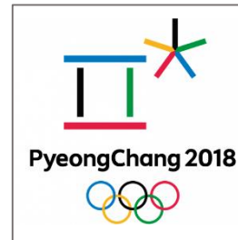
Uber & NBC partner for the 2018 Olympic Games