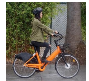
Spin adds ebikes to its urban bikesharing fleets