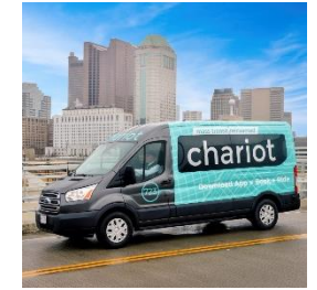
JPMorgan Chase partners with Chariot in Columbus