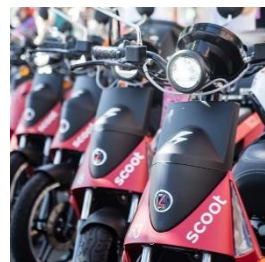
Scoot expands its electric vehicle sharing service