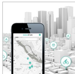
Koloni & Defiant partner for Super Bowl bikeshare