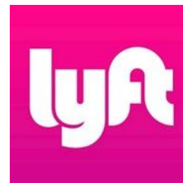
Lyft Concierge service opens to all businesses