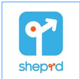
Sheprd offers ridesourcing service for children/teens