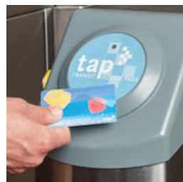
L.A. Metro to make TAP service more multimodal