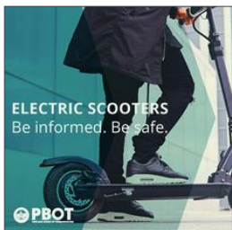
PBOT issues e-scooter permits to Skip & Bird