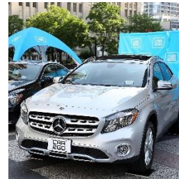
Car2Go carsharing comes to the City of Chicago (Photo by Car2Go )