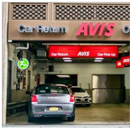
Avis Budget Group & Lyft partner for vehicle access