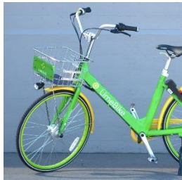
Washington University in St. Louis & Lime partner