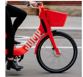
Uber launches JUMP e-bike service in Denver