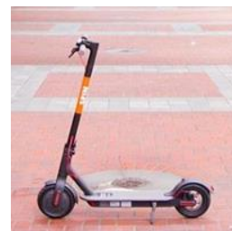
Spin transitions to an all e-scooter service in D.C.