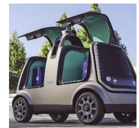
Kroger & Nuro partner to test AV grocery delivery