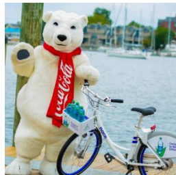
Pace partners to launch bikeshare in Annapolis