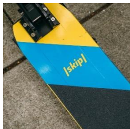
San Francisco grants permits to Skip & Scoot