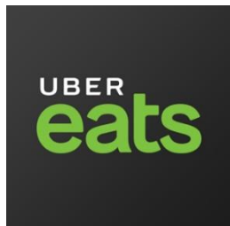
Uber Eats teams up with restaurants in Lincoln, NE