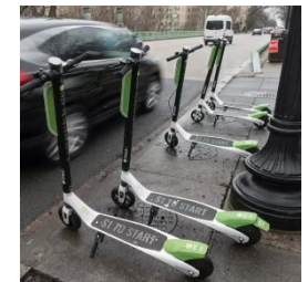
Lime transitions to an all-scooter fleet in D.C.