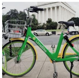
D.C. extends its dockless pilot to the end of the year