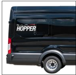
Rabbitransit launches new microtransit service