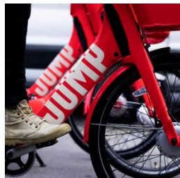
Bikeshare providers apply for permits in Seattle, WA