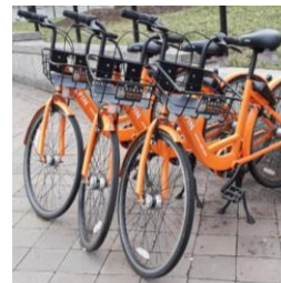
Bikeshare program to come to Waco, TX in fall