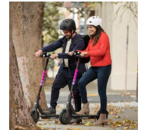
Lyft introduces scooter-share service in Denver