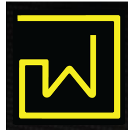
Waave launches taxi ride-hailing app in New York