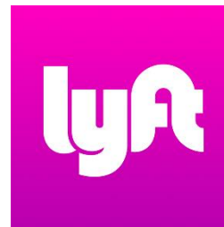
Lyft & the Santa Monica Pier Corporation partner