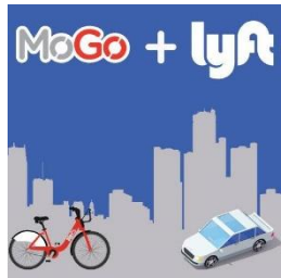
MoGo bikeshare & Lyft partner for ride discounts