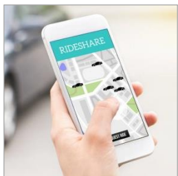
Rider University partners for free late-night rides