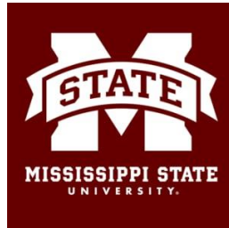
MSU now offers Limebike bikeshare across campus