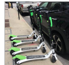
Lime e-scooters come to downtown Cincinnati, OH