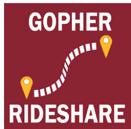
University of Minnesota rolls out rideshare app