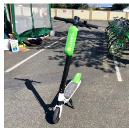
Lime brings scooters & bikeshare to Tacoma, WA