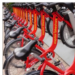
Capital Bikeshare in D.C. adds electric bikes to fleet