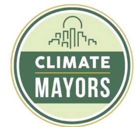
LA forms electric vehicle partnership with 30 cities