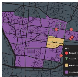
Washington University & Uber team up for rides