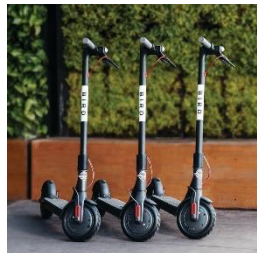
Bird expands e-scooter service to Tacoma, WA