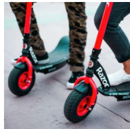
Razor launches scooter-share service in Dallas