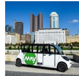
May Mobility to test self-driving shuttles in OH