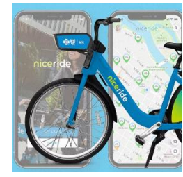
Minneapolis bikeshare, Nice Ride, goes dockless