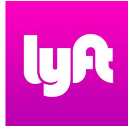
Lyft adds public transit information to app in CA