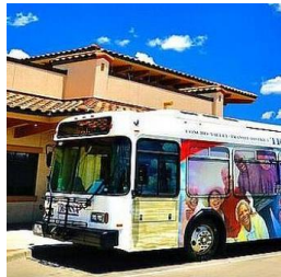
Concho Valley Transit partners for new bus app