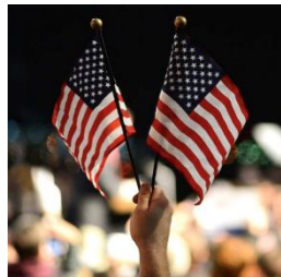
Uber & Lyft to help voters go to polls November 6