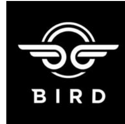
Bird introduces delivery service and Bird Zero