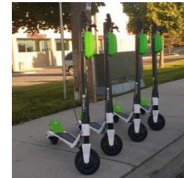
Dockless companies to soon expand to Boise, ID