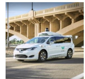
Waymo launches AV ride-hailing service in Phoenix