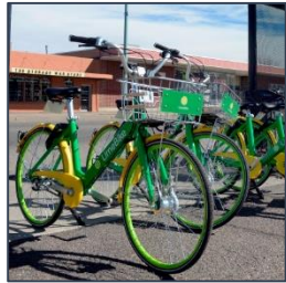
Lime rolls out its electric bikes in Denver, Colorado