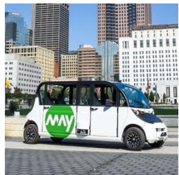
Columbus's driverless shuttle begins operations