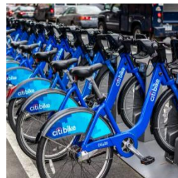
Lyft to expand Citi Bike significantly in New York