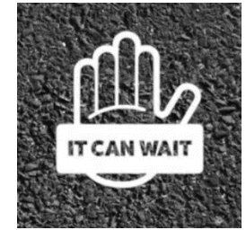
Bird & AT&T partner to tackle distracted driving