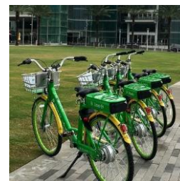
Lime launches e-bike fleet in Orlando, Florida