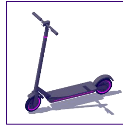
Lyft e-scooters come to Arlington, Virginia