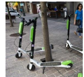
Austin to allow e-bikes & scooters on some trails