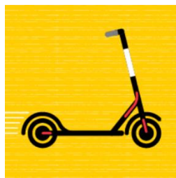
Kansas City to launch e-bike & scooter pilot