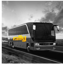
Rally & Daimler partner for on-demand bus rides