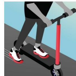
Uber rolls out JUMP e-scooters in Sacramento