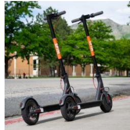
Spin & JUMP to expand service to Arlington, VA