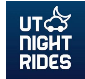
SURE Ride rebrands Lyft pilot as UT Night Rides