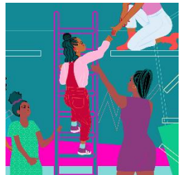
Lyft to offer Black History Month initiative for rides