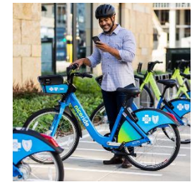
Nice Ride to add e-bikes to Minneapolis bikeshare