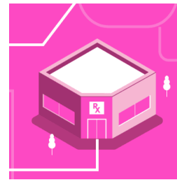
Lyft expands its medical transportation services