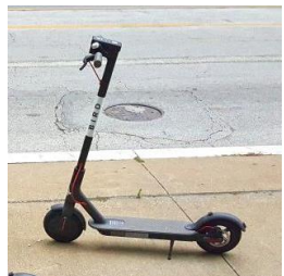
Scooters may come to the Town of Normal, IL