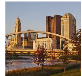
Columbus, OH to launch second AV shuttle pilot