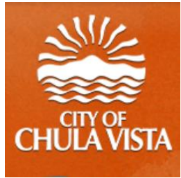
Chula Vista, CA approves pilot for dockless mobility