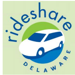
DART to offer free ride-share via RideShare DE