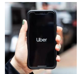
Denver transit tickets are now available via Uber