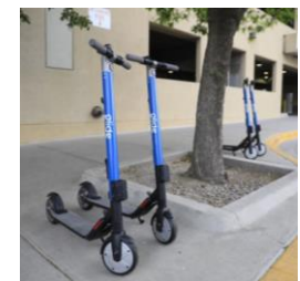
Glide scooters roll out in El Paso via pilot program