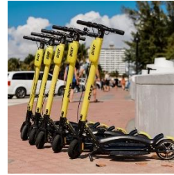
Electric scooters return to Portland via new pilot