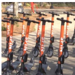
Spin and VeoRide launch scooters in Knoxville, TN