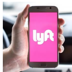
Lyft to expand grocery access rides nationwide