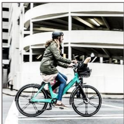
Waco, Texas approves pilot with Gotcha Bikes