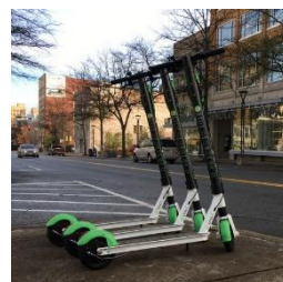
Little Rock extends Lime scooter pilot program