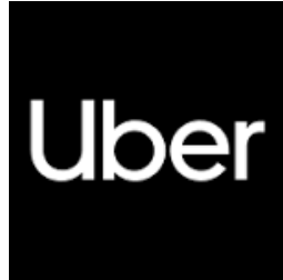
Uber partners with Police Department in Georgia