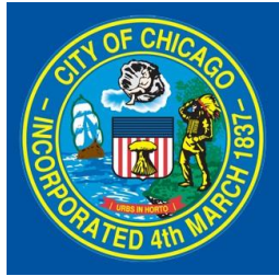
City of Chicago to launch scooter pilot this June