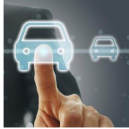
Ford to expand GoRide Health service nationally