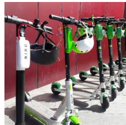
Seattle Mayor announces plans for scooter pilot