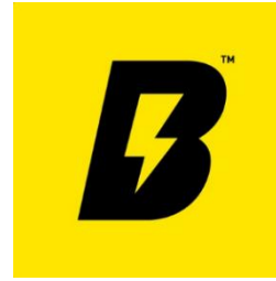
Bolt Mobility launches e-scooters in Atlanta