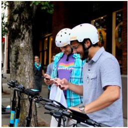
Tallahassee to launch 3 month e-scooter pilot