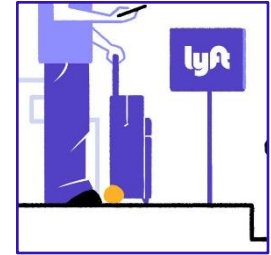
Lyft & Uber launch PIN-based pick-up pilots