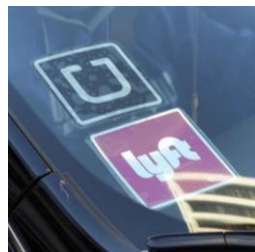
Uber & Lyft to now send alerts to prevent 'dooring'