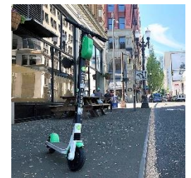
Everett launches 3 month e-scooter pilot program