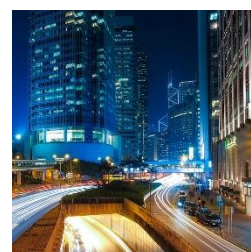
City Tech Collaborative rolls out mobility initiative