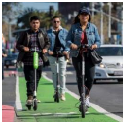
Wichita moves forward with scooter pilot plans