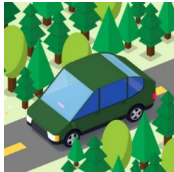
PGE & Lyft partner to offer free EV charging