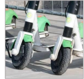
City of Omaha partners with Lime & Spin for pilot