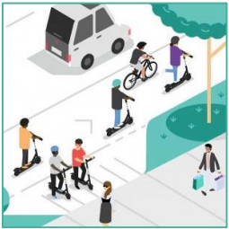
Montgomery County, MD launches e-mobility pilot