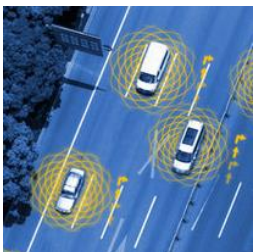
Iowa City publishes plan for AV adaption & equity