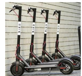
Cleveland approves pilot program for e-scooters