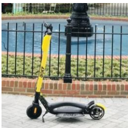
Bolt e-scooter service to launch in Richmond, VA