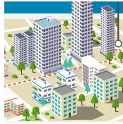
Albuquerque rolls out pilot with Spin & Zagster