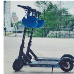
Blue Duck e-scooters come to Laredo, TX