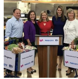
Lyft partners for Phoenix grocery access program