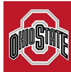
Ohio State launches Lyft Ride Smart program