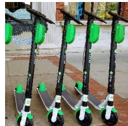
Lime e-scooter service comes to Rochester, NY