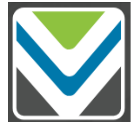
Rock Region Metro tests out microtransit service