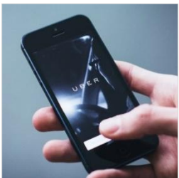
GoTriangle partners with Uber & Lyft for new pilot