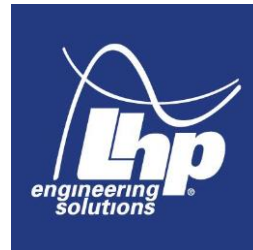
LHP & PerceptIn partner for automated mobility