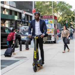
Baltimore grants permits to 4 scooter companies