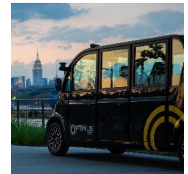
Optimus Ride rolls out driverless shuttle pilot