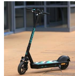
Scooter pilot program launches in Tallahassee