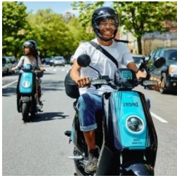
DDOT to launch moped sharing pilot program