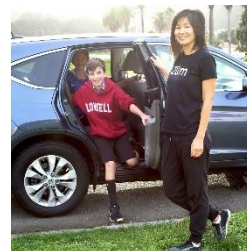
Züm ride-hailing service for kids is coming to D.C.