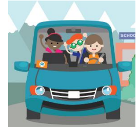
HopSkipDrive offers ride service for kids in Seattle