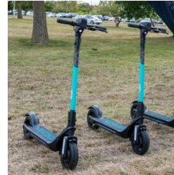
MSU forms partnership for scooters & ride data