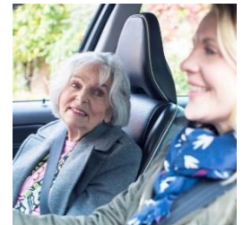
San Diego pilot offers free Lyft rides to seniors