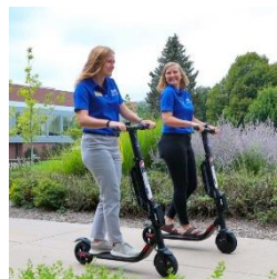
Dockless scooters now available for use at UNK