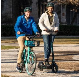
Veoride bikes & scooters roll out in Fort Wayne, IN