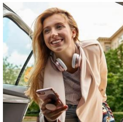
Uber partners for safety campaign for students