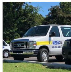
TN pilot for non-urgent medical rides launches