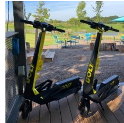
Bolt launches redesigned scooters in Memphis, TN