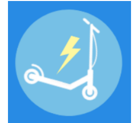
City of Tucson launches scooter pilot program