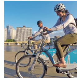
University of Pittsburgh partners for bikeshare