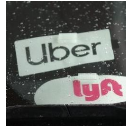
Seattle partners with Lyft & Uber to aid immigrants