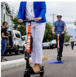
Zagster rolls out Spin scooters in Orem, UT