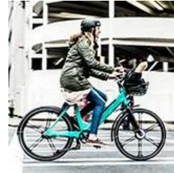
Gotcha electric bikeshare launches on UA campus