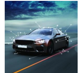
Waycare partners for CV data sharing in Nevada