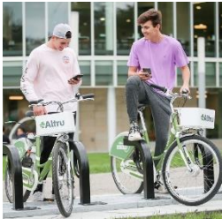
Grand Rides bikeshare is live in Grand Forks, ND