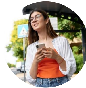
RTA & the Transit app team up in New Orleans