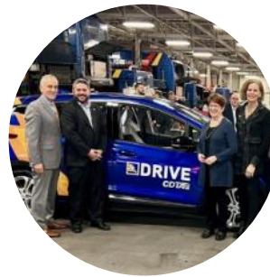
CDTA launches DRIVE carsharing program