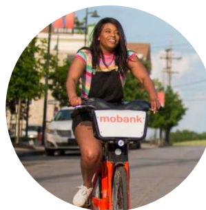
NACTO releases new micromobility reports