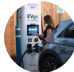
Lyft & EVgo team up for discounted EV charging