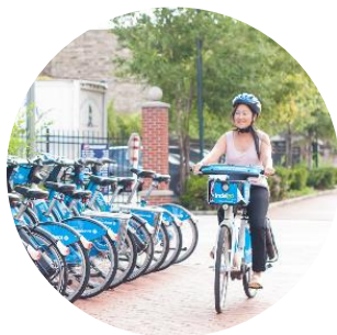
Indego partners for bike-share benefits in Philly