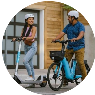
City of San Ramon rolls out micromobility pilot