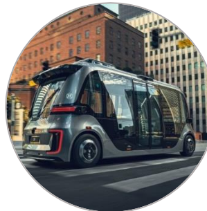
Beep & ZF Group partner for automated shuttles