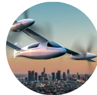
City of LA publishes an AAM Primer for Cities