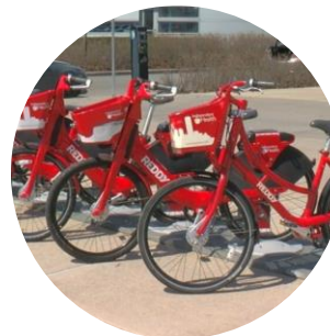
Reddy Bikeshare service expands into state parks