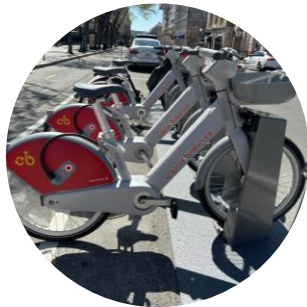
Capital Bikeshare rolls out new electric bikes