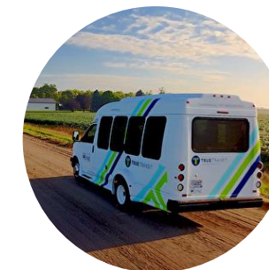
Minnesota shared mobility project shares findings