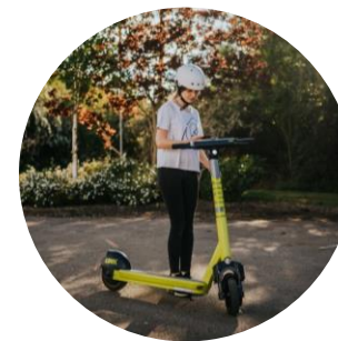
City of Eugene launches electric scooter pilot