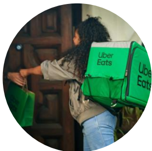
Uber Eats partners for new food delivery initiative