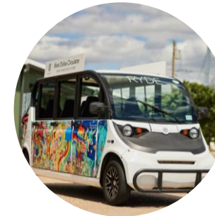
DART, Toyota, & Circuit partner for free rideshare