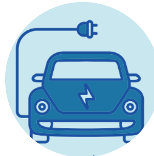
Stockton Mobility Collective launches bike & carshare