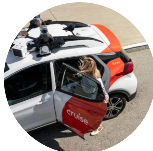
Cruise AV ridehailing to come to Houston & Dallas