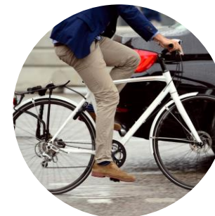
City of Pensacola offers Employee Bikeshare