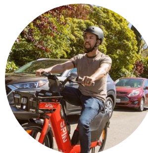
Millbrae & Burlingame team up with Spin for bikeshare