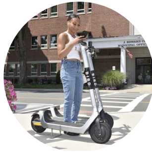
Bird scooters come back to West Springfield, MA