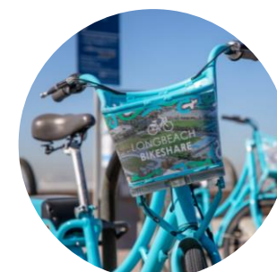
City of Long Beach rolls out Bike Share for All