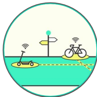
OMF releases Mobility Data Specification (MDS) 2.0