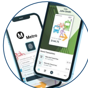
Tru partners with LA Metro for Mobility Wallet project