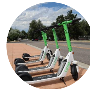
Boulder expands scooter-share after successful pilot