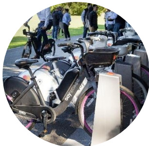
Lyft bikeshare program expands in San Francisco