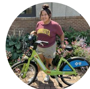
UMN Morris launches new bikeshare partnership