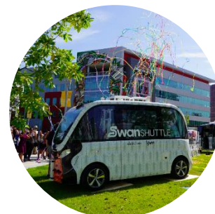
City of Orlando pilots AV rides with SWAN Shuttle