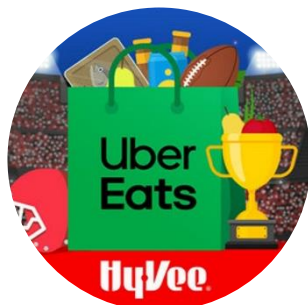
Uber & Hy-Vee team up for Midwest grocery delivery