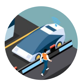
Testing for new automated shuttle kicks of at Mcity