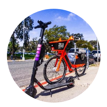
NACTO's 2022 Shared Micromobility Report is out