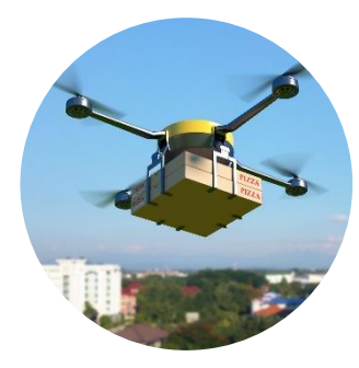
Upstate Medical tests drone prescription delivery service