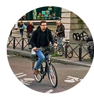
Rockdale County, Georgia launches 2Wheel Fitness